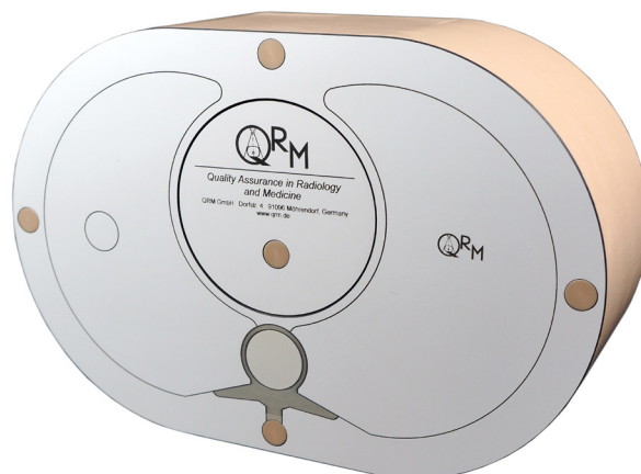
QRM-Thorax-Dosimetry (dosimetry bores filled with detachable plugs)

Phantom heights can be adjustet (e.g. 150 mm, 200 mm) upon demand.