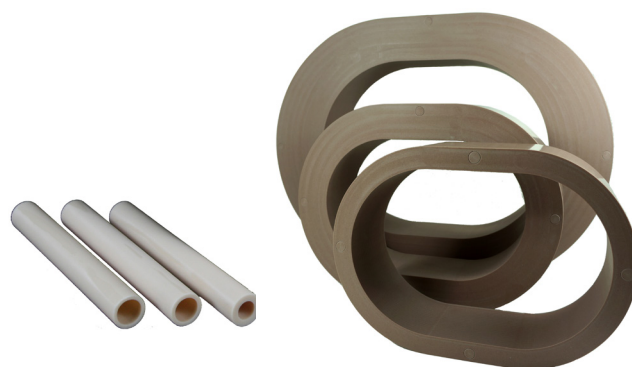
CT chamber adapters and Extension Rings with dose bores (and plugs)